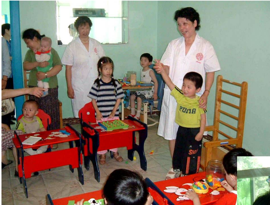
Amity Grandma Project