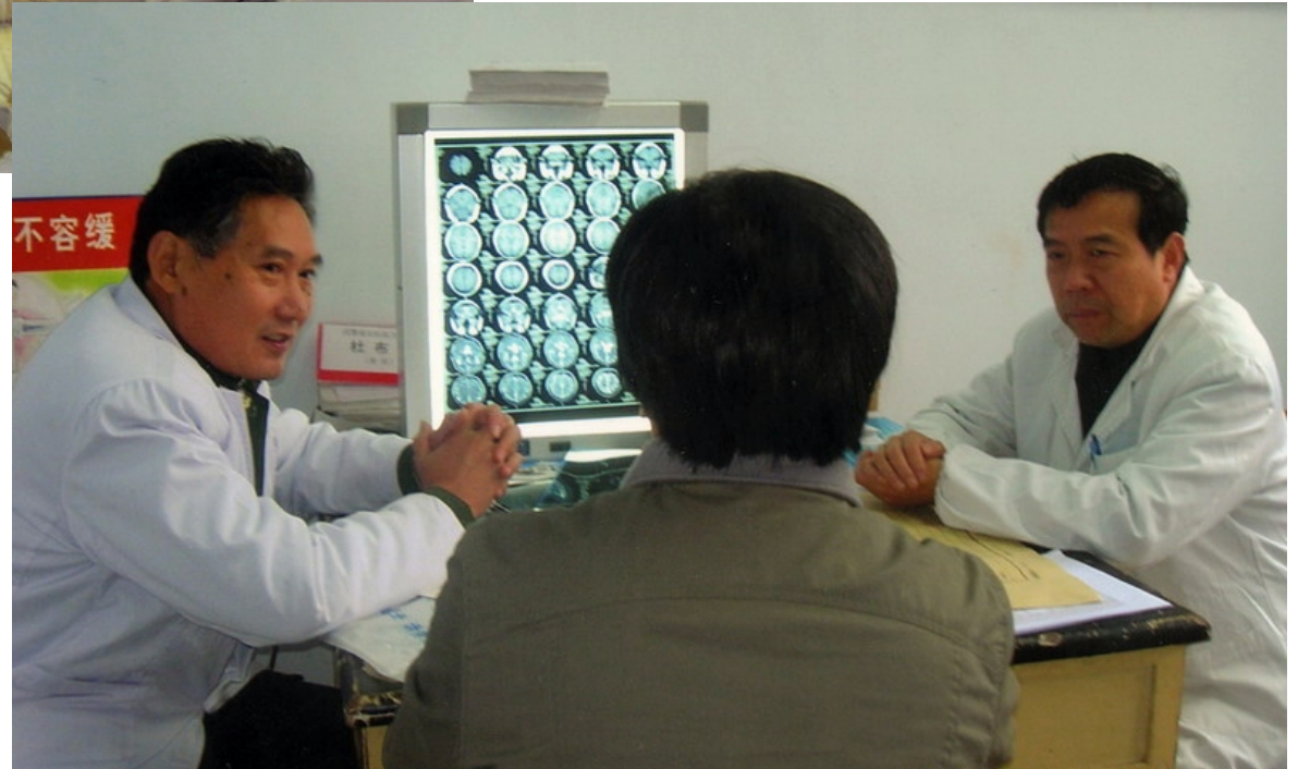
Amity voluntary medical service in rural areas