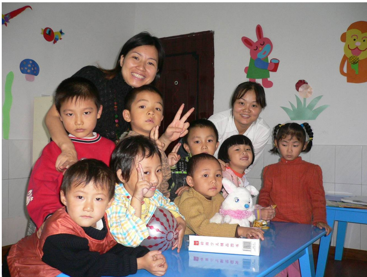
Teachers and students in a bilingual deaf education class in Leshan, Sichuan sponsored by Amity