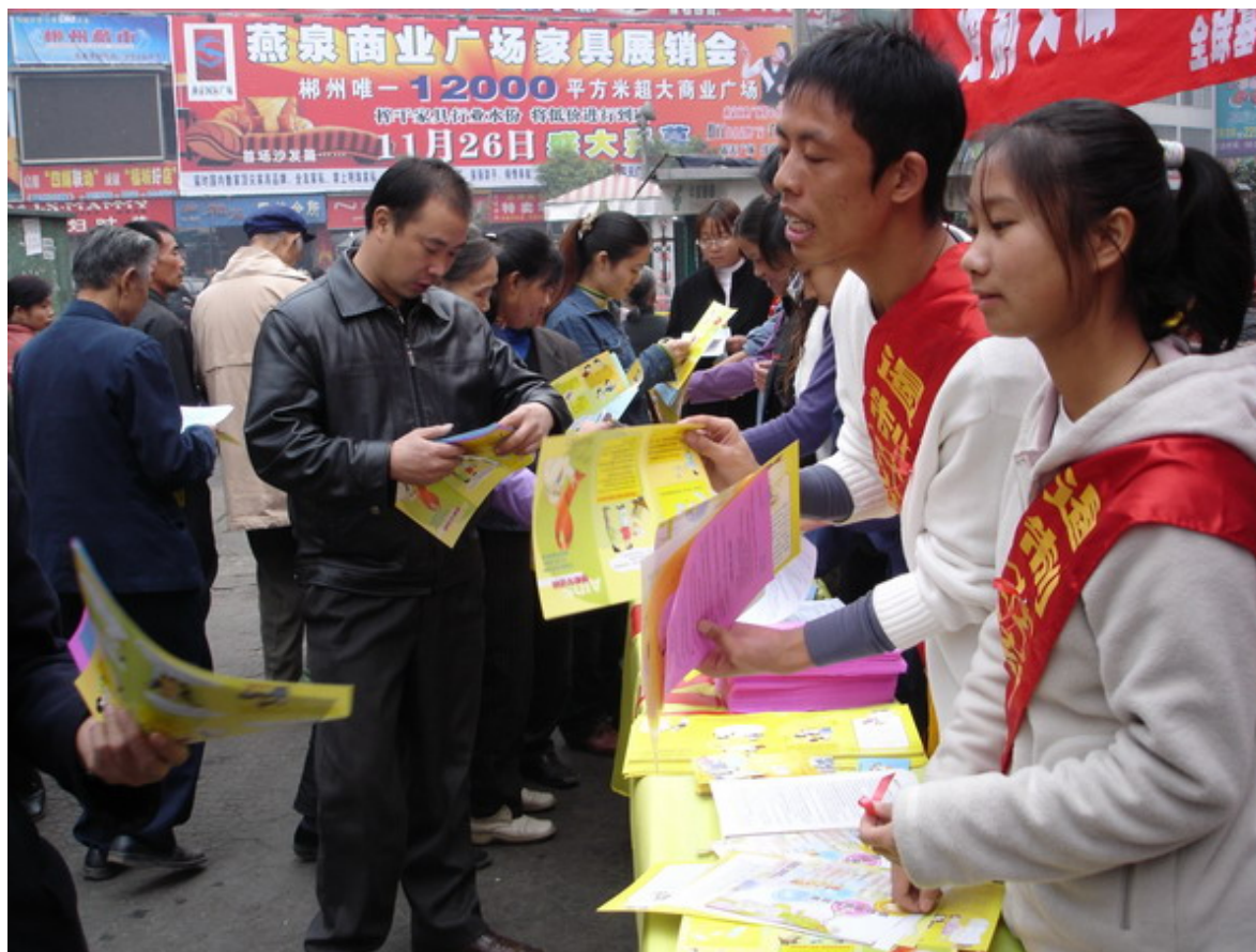
HIV/AIDS prevention education in Hunan Christian Church