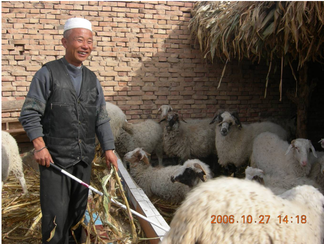
Amity Community-based Rehabilitation Programme for the blind