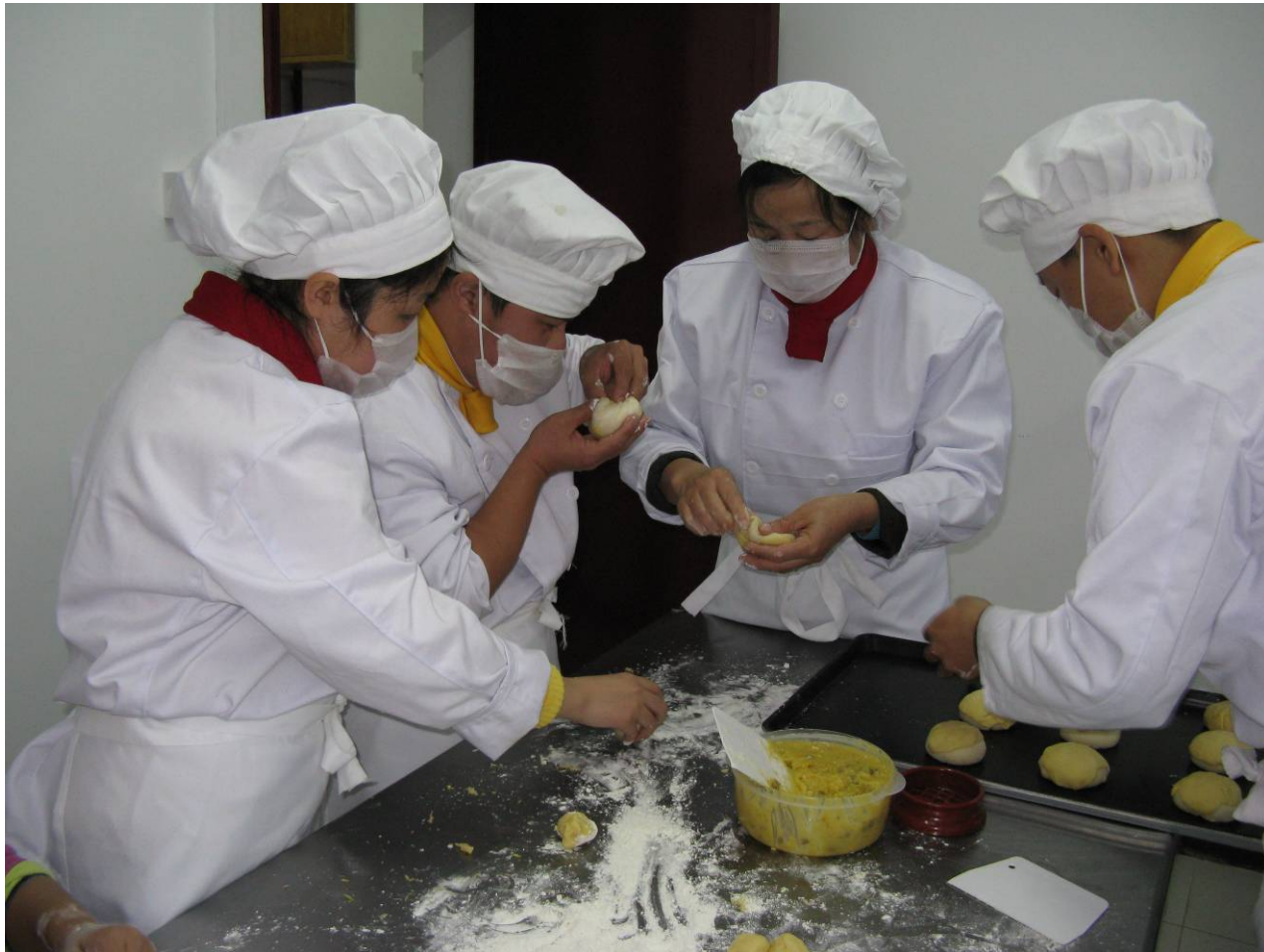
Amity Bakery is the vocational training base for students of Amity Home of Blessings