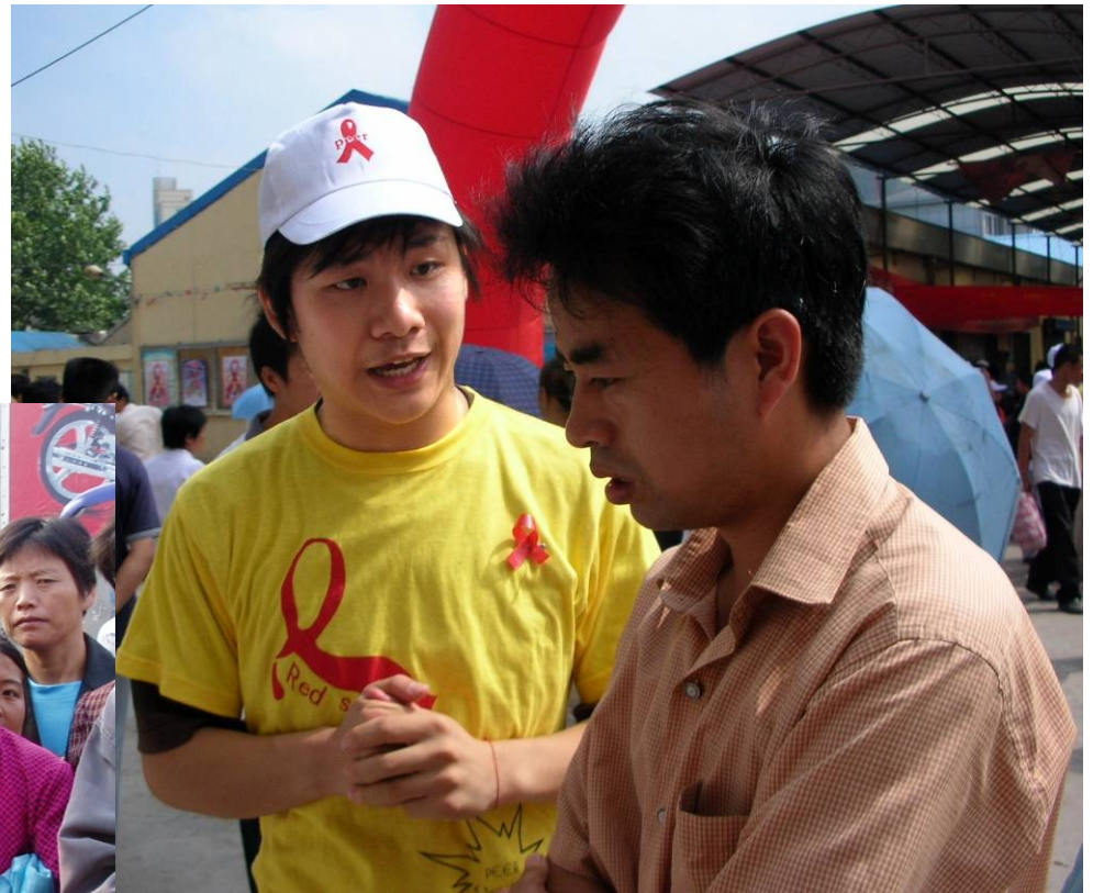
HIV/AIDS Awareness Education