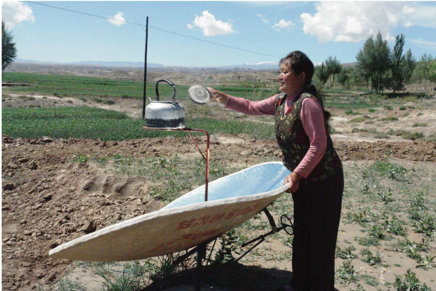
Solar energy stoves