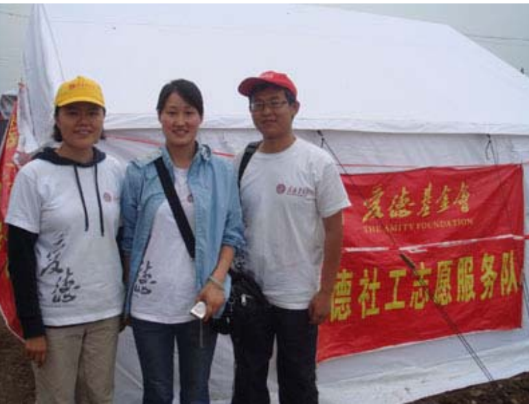
Amity staff and volunteers in Sichuan for earthquake disaster relief