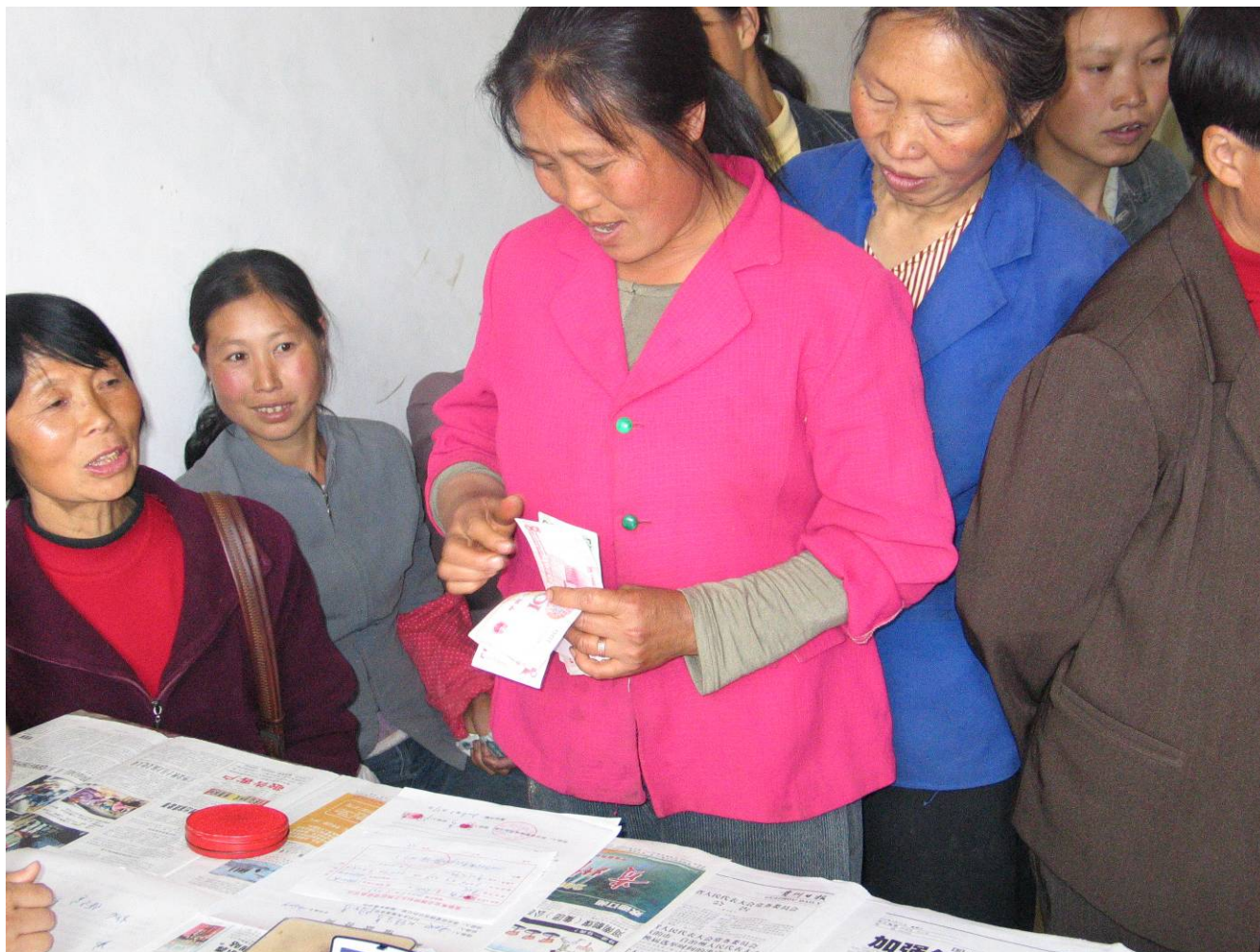
Micro-credit for peasants