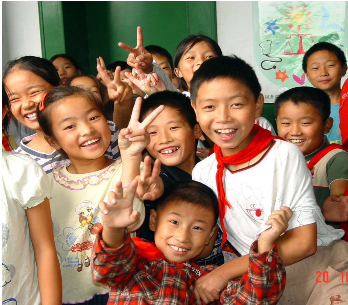
Sponsored Schools for Children of Migrant Workers