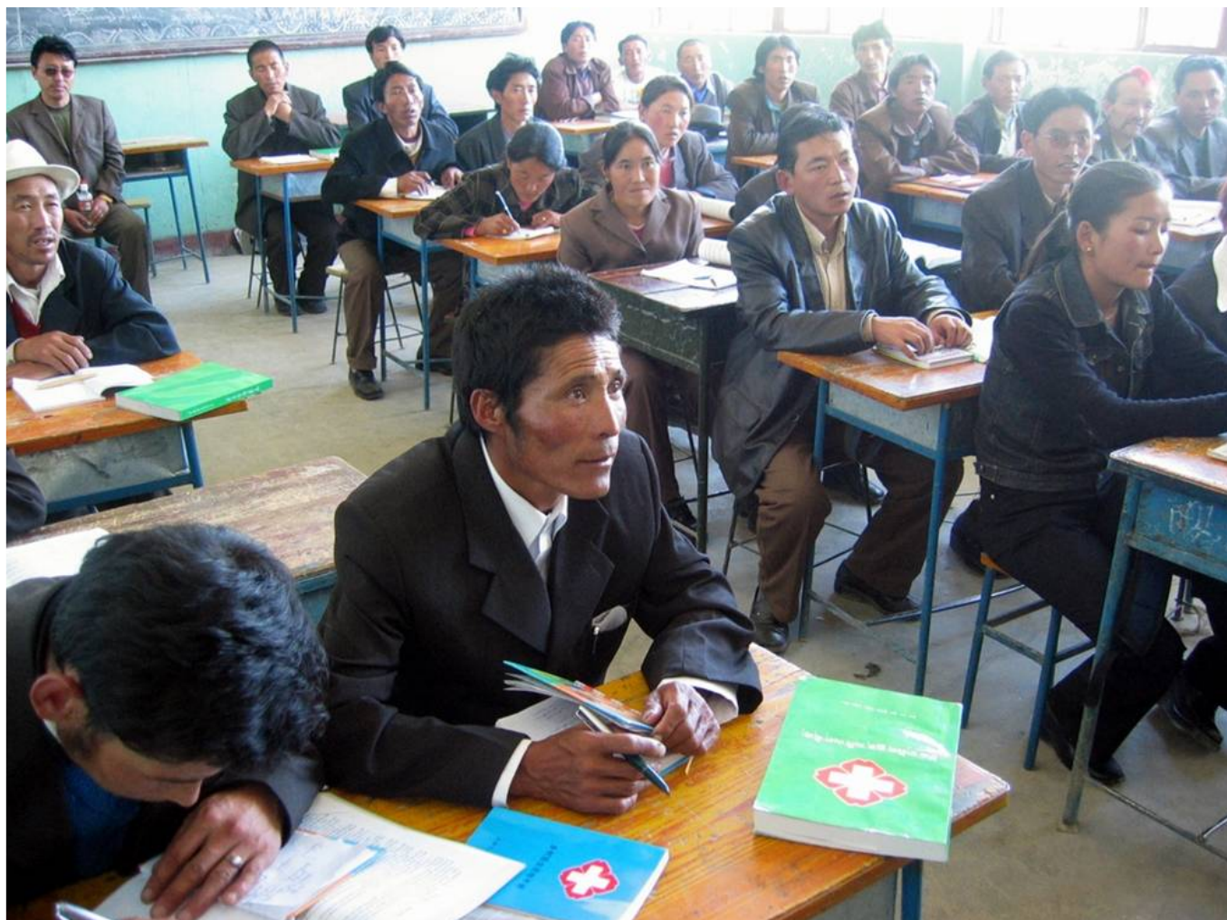
Village Doctor Training