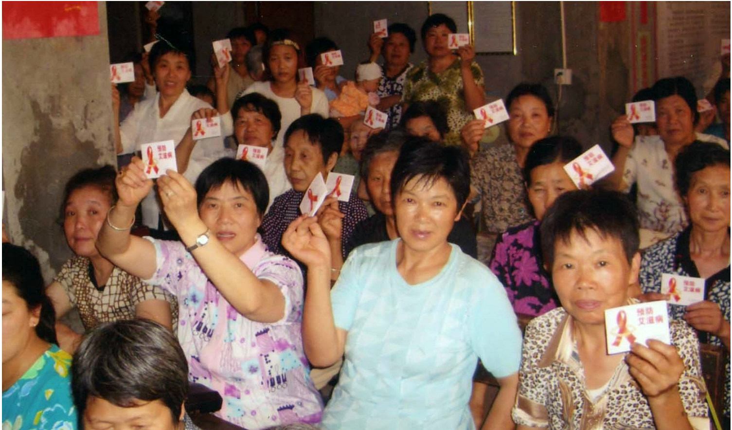
HIV/ AIDS Awareness Education in Sichuan church