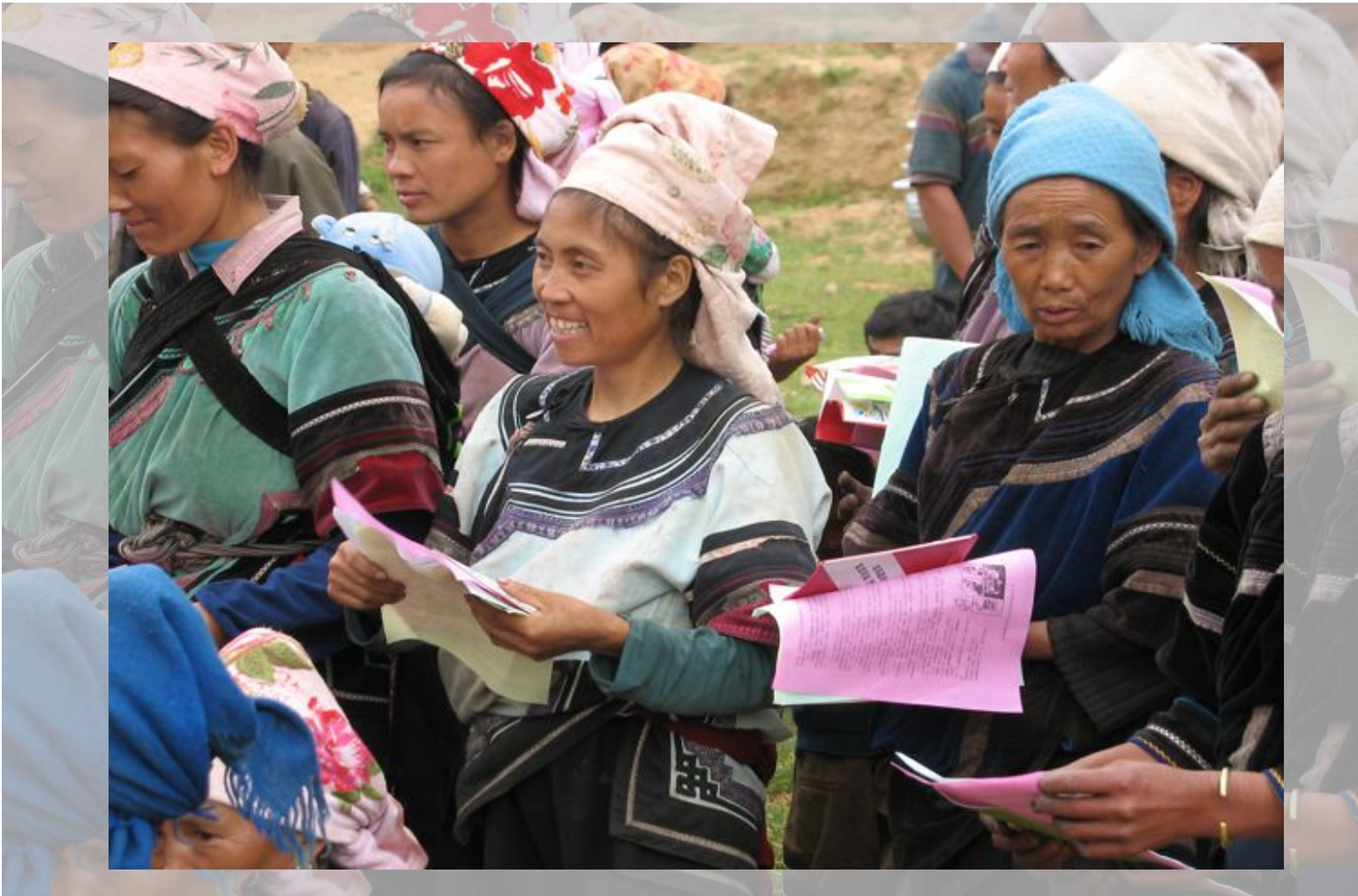
Hani women in hygiene training